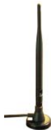
Mount With 5dBi Rubber Duck Antenna